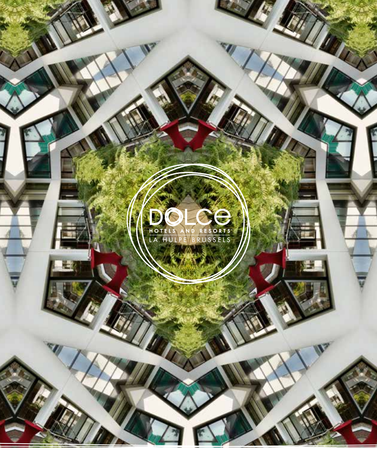
connect by discovering